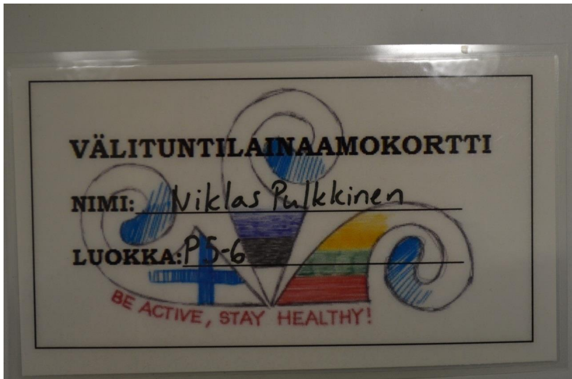
Tool kit card