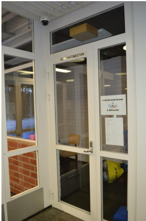
Tool kit room

Pupils who wanted have tool kit card as library card they have to show when they borrow something. They had to sign the special agreement to accept the rules of borrowing things. Also their parents had to sign the form. Pupils take care themselves the whole borrowing system at school and the all pupil are very enthusiastic about this new system.